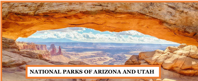
NATIONAL PARKS OF ARIZONA AND UTAH

865-236-9026 or 865-908-1101 or email Super.Partners@tnstatebank.com