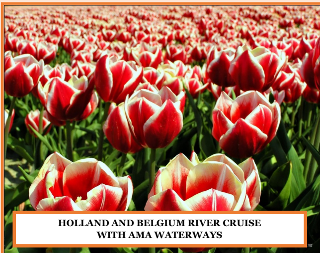
HOLLAND AND BELGIUM RIVER CRUISE WITH AMA WATERWAYS