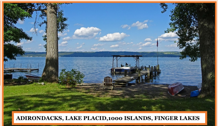
ADIRONDACKS, LAKE PLACID, 1000 ISLANDS, FINGER LAKES