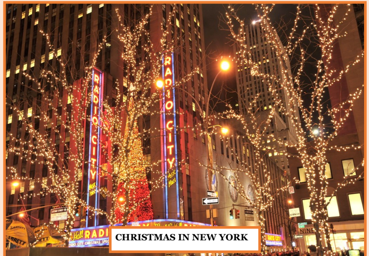
CHRISTMAS IN NEW YORK